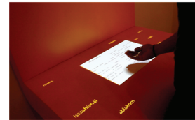
Patch the poem